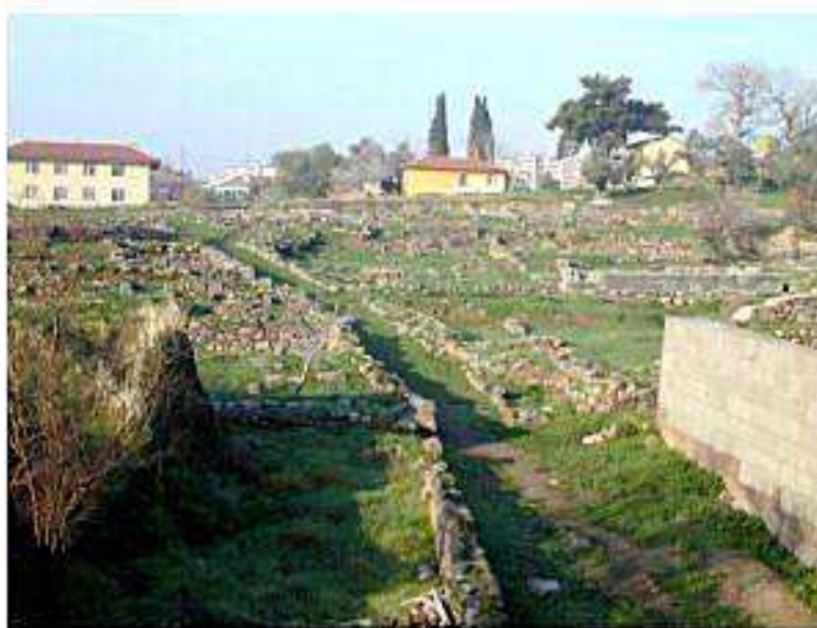
Showing the ancient ruins of Smyrna

Smyrna, is the third largest city in Turkey. It is now called Izmir and is about 50 miles north of Ephesus; it lies at the sheltered head of a gulf extending thirty miles inland.